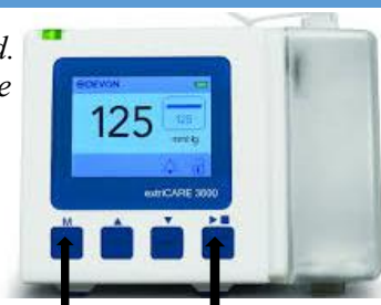
Press and hold both buttons

The device will lock automatically if no button is pressed after 3 minutes. When locked, any button pressed will illuminate the display with the current settings, but the buttons will not take any input, and the backlight to the screen will turn off.